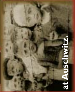
The children at Auschwitz.

On June 22, 1941, Hitler launched the invasion of the Soviet Union. Special mobile killing squads composed primarily of German SS and German Security Police, murdered approximately 1,500,000 Jews. On the other hand, the forests in the German occupied areas were conducive to the development of partisan warfare.