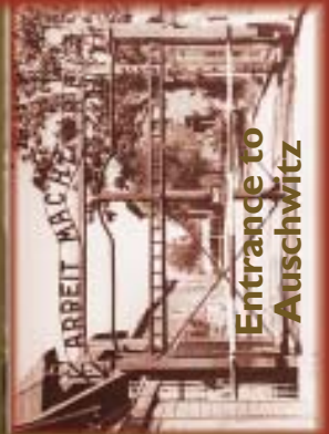
Entrance to Auschwitz